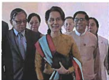
THOUSANDS TO SUPPORT: Myanmar's State Counsellor Aung San Suu Kyi departs from Naypyidaw International Airport ahead of her appearance at the International Court of Justice to defend the country against charges of genocide of its Rohingya Muslim minority, in Naypyidaw, Myanmar, Dec. 8.

YANGON (Reuters) - Myanmar leader and Nobel peace prize laureate Aung San Suu Kyi departed on Sunday for the U.N's top court in The Hague to defend the country against charges of genocide of its Rohingya Muslim minority.