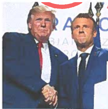
TECH TAX: French President Emmanuel Macron, right, and President Donald Trump shake hands during a joint-press conference in Biarritz, southwest France on Aug. 26, on the third day of the annual G7 Summit. The U.S. has proposed tariffs on roughly $2.4 billion in French products in response to a tax on digital revenues that hits large American tech companies.

The tariffs would be imposed after a public comment period concludes